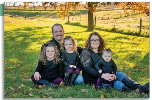
The Neibling family

Between unforgiving weather conditions and tumbling grain prices, farming is going through a challenging time. Nevertheless, we farmers remain determined to continue caring for the land. KSA works resolutely to promote the interests of this state's soybean farmers. I am proud of the work it does for agriculture.